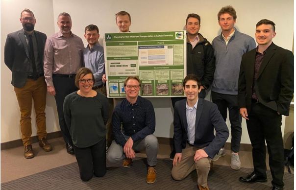
MSU Urban Planning Student Presentation in East Lansing: April 29, 2022

A team of Michigan State University urban planning students recently completed a project to analyze trails and sidewalks in the Township and to develop a framework for evaluating priority areas for future trail and sidewalk improvements. The team presented