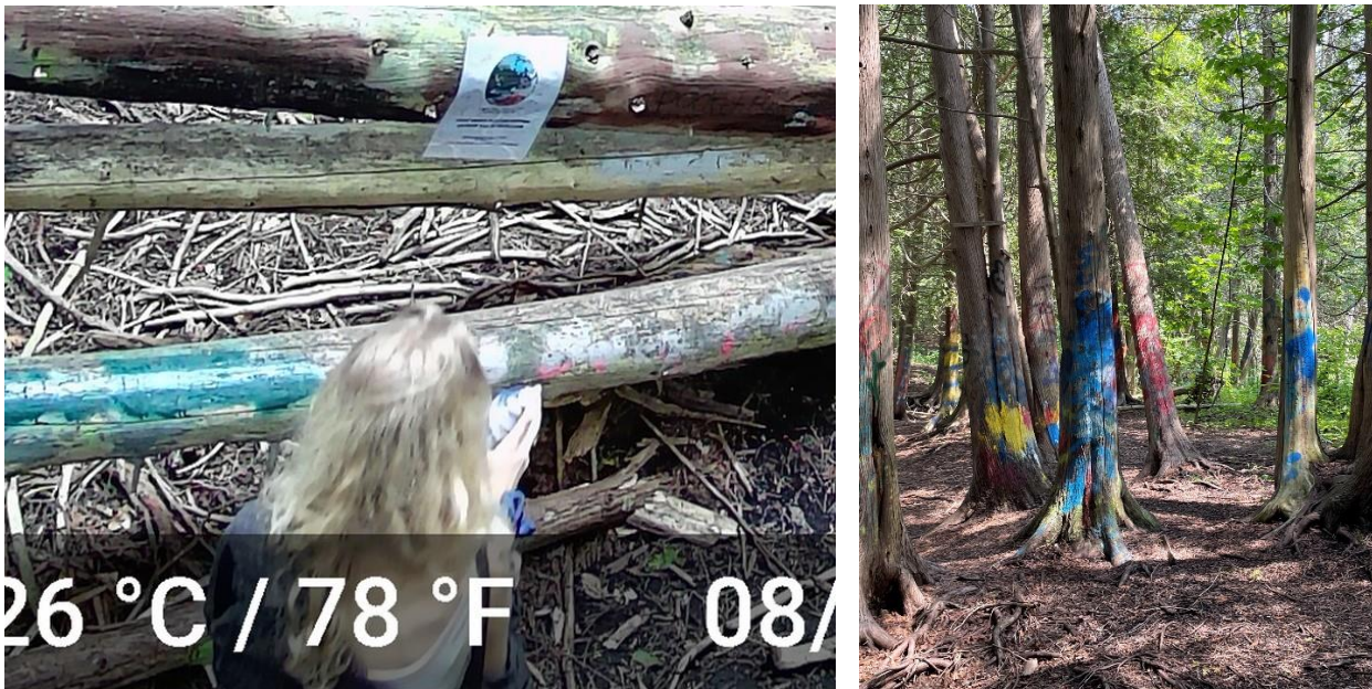
Cameras and signs were installed (left) to help cut down on graffiti spreading from beyond the Hippie Tree to other parts of the Commons Natural Area (right)