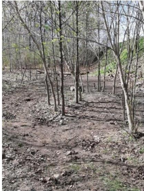
Before and after trash cleanup event with Boardman River Clean Sweep volunteers

The Parks and Recreation Commission met six times in 2021 on the dates listed below. The Commission has adopted a bi-monthly meeting schedule since 2020 to ensure meeting at least six times per year. This schedule will continue in 2022.