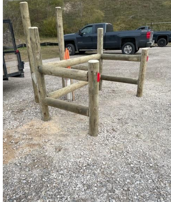
Park development at River East Recreation Area included a pavilion (left) and trash enclosure (right)

The Township Engineer has refined previous conceptual designs for the site and developed a preliminary Opinion of Probable Construction Cost (OPCC), which divides the park development projects into three phases. Further discussion and public engagement in 2022 will determine the direction and scope of any future improvements at this park.