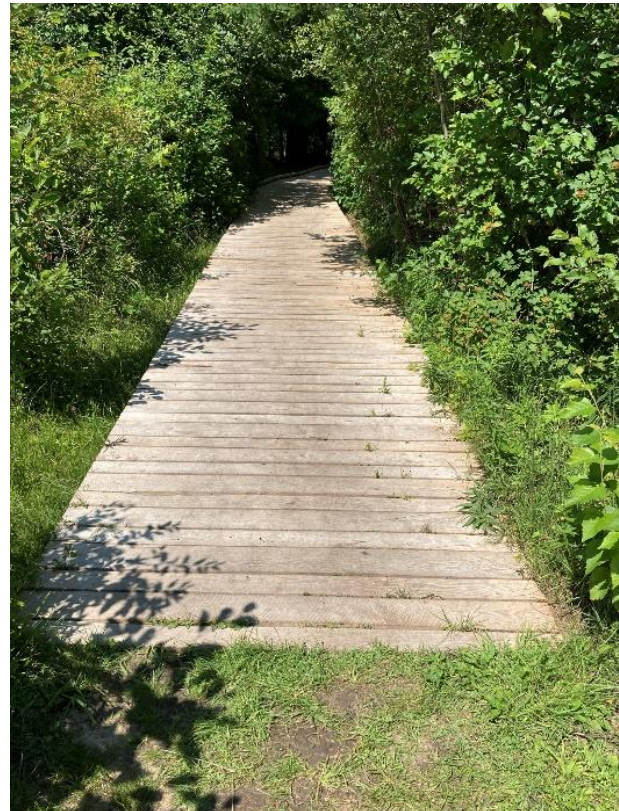
New boardwalk along the Peace Trail in Boardman Valley Nature Preserve

Development of River East Recreation Area began in 2021 including a new gravel parking area and sign, and construction was started on a new pavilion. Commissioners identified further improvements to this park, including dog parks, fencing, and other general site improvements, as a 2022 high priority project. Development of this park has been identified as a key near-term priority. Construction on the pavilion is anticipated to be completed in early 2022, after which the pavilion will be made available for rental. Fees for the pavilion rental are anticipated to be established in early 2022.