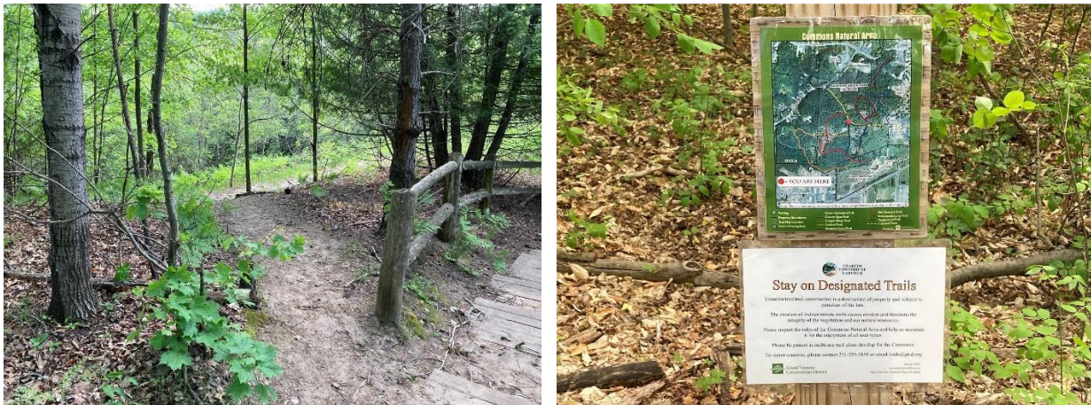
Left: rogue trail; Right: sign stating, “Stay on Designated Trails”

Design Plan: Once the deed restriction was removed, the Township was able to focus on preparations for the Design Plan process. Staff and Commissioners worked on an Existing Conditions Report describing the current state of the Commons Natural Area. The Existing Conditions Report outlines the topography, natural features, trails, and access points, and describes some current challenges including the rogue trail construction, graffiti, and encampments (see pictures below).